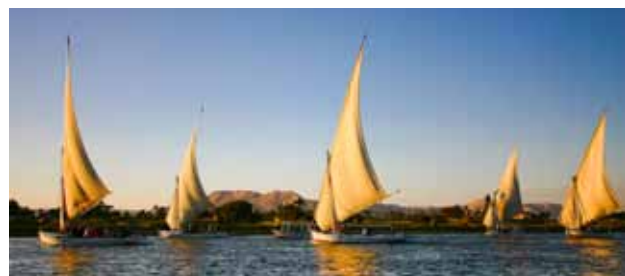
Feluccas on Nile River

No matter where your journey takes you, the inherent hospitality of the Egyptian people always has visitors coming back for more. You'll feel it on a tranquil cruise down the Nile River , during a snorkeling tour through the pristine waters of Ras Muhammad National Park , near glamorous Sharm-el Sheikh , or while immersing yourself in the ancient history—and romantic atmosphere—of Aswan .