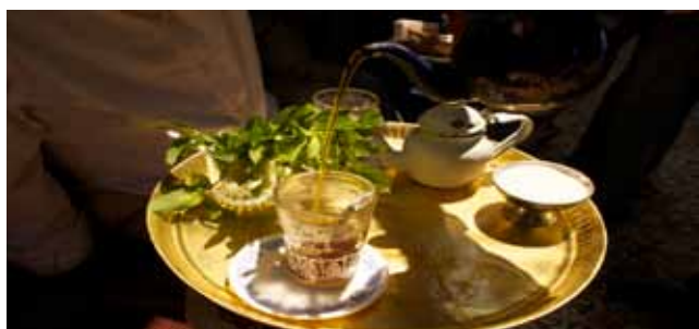
Refreshing mint tea service