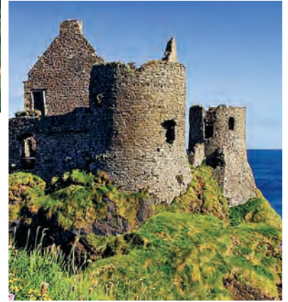
Clockwise from top left: the Carrick-a-Rede Rope Bridge; the Giant's Causeway; Dunluce Castle.